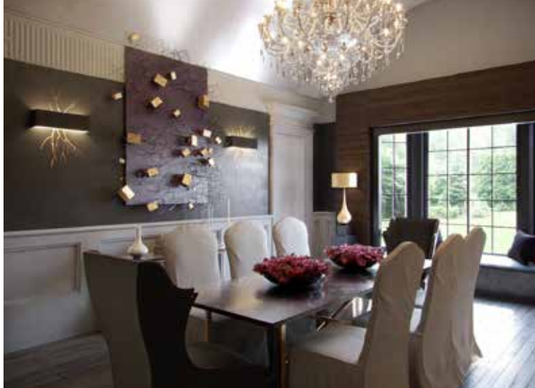
With an approximate total area of 17,000 square feet, this estate residence received a full interior renovation featuring an eclectic mix of classical and modern design.

This kitchen remodel, part of a 3,400-square-foot renovation in Deering Bay, reflects the owner's love for cooking and entertaining. The design provides an abundance of working space and top-of-the-line appliances.