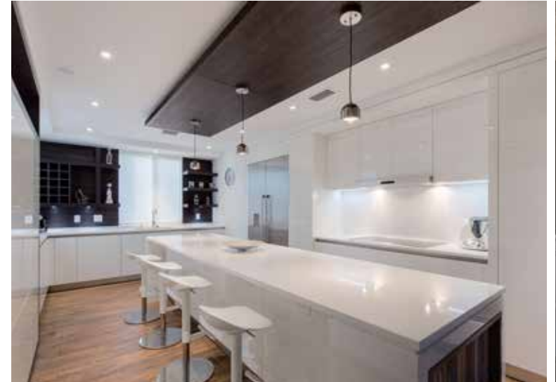
This kitchen remodel reflects the owner's love for cooking and entertaining. The design provides an abundance of working space, top-of-the-line appliances and a balance of lighting.