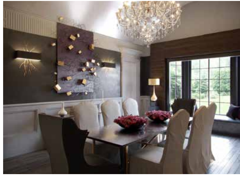
With an approximate total area of 17,000 square feet, this estate residence received a full interior renovation featuring an eclectic mix of classical and modern design.