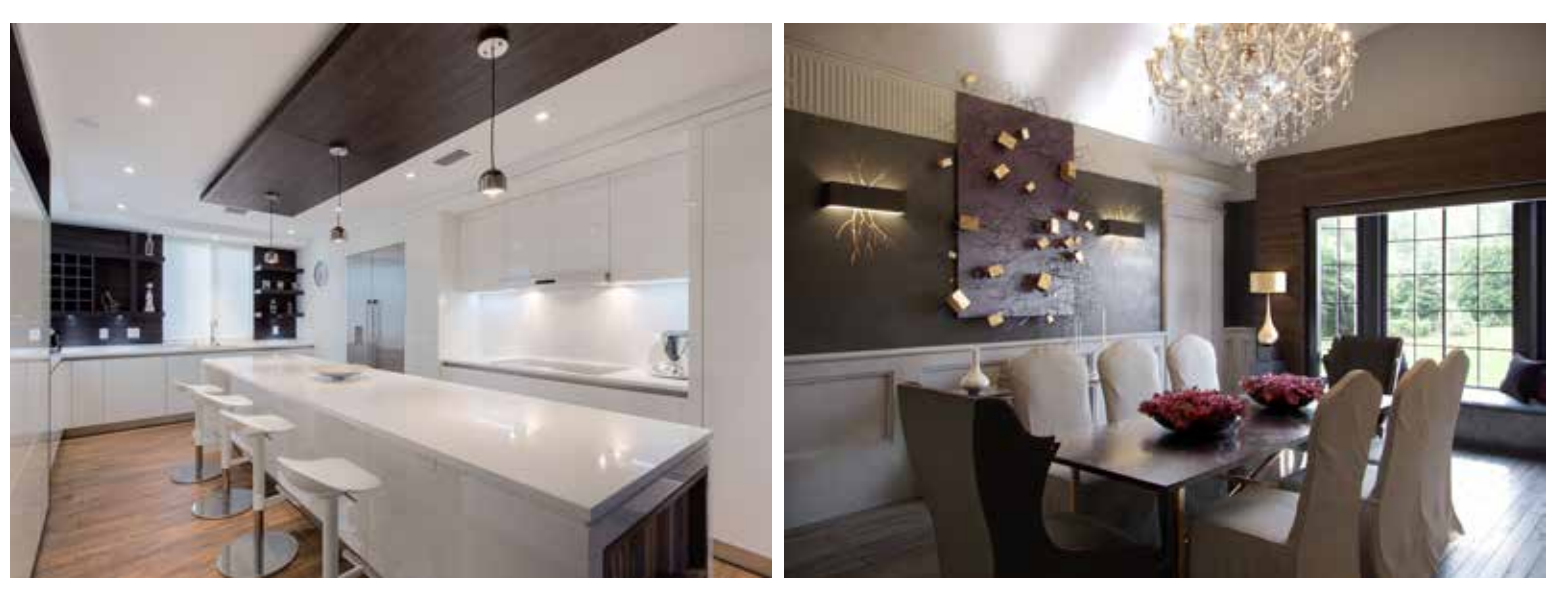
This kitchen remodel, part of a 3,400-square-foot renovation in Deering Bay, reflects the owner's love for cooking and entertaining. The design provides an abundance of working space and top-of-the-line appliances.

C A good design balances form, function and context. A great design transpires emotion, allowing the client to take ownership of the project and enjoy it." –Sandra Diaz-Velasco