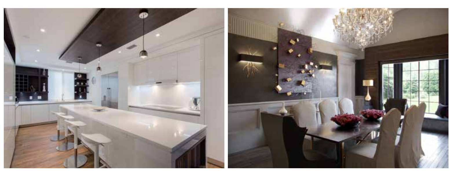
This kitchen remodel reflects the owner's love for cooking and entertaining. The design provides an abundance of working space, top-of-the-line appliances and a balance of lighting

C A good design balances form, function and context. A great design transpires emotion, allowing the client to take ownership of the project and enjoy it." –Sandra Diaz-Velasco